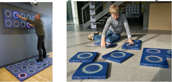
Fig. 1. The modular robotic tiles for sensorimotor play (left) and for construction play (right).

We developed modular robotic tiles according to the key features of the design approach described above, in order to create a modular playware with the possibility for users to modify the physical shape and make easy setup for a variety of play activities. Further, we designed the modular system with the possibility of exclusion of external host computer, with self-contained energy source, with wireless communication (local and global), and with different games.